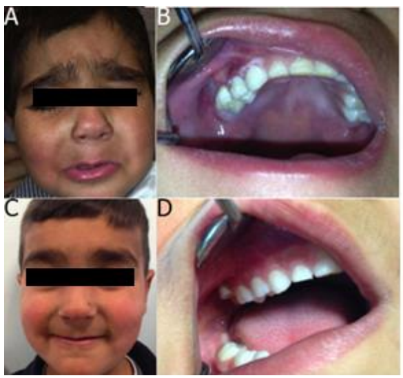
Figure 3. A and B: Post treatment photos showing resolution of facial and intraoral swelling after 3 weeks of chemotheraphy. C and D: After 12-month follow-up

the intraoral disease, represented by stabilized teeth and resolved alveolar mucosa swelling, was observed within three weeks after chemotherapy (Fig. 3-A, B) and a 12-month follow-up (Fig. 3-C, D). The patient is being followed up closely.