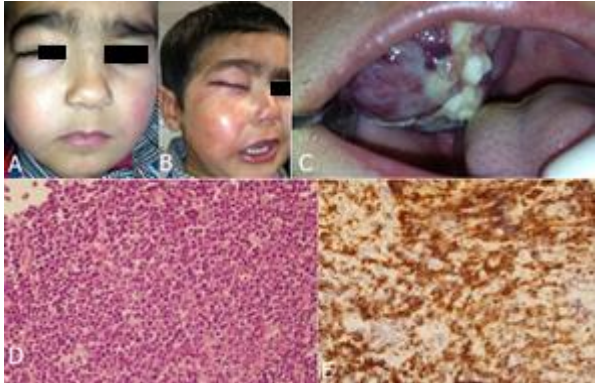
Figure 1. A : An extraoral appearance on day of admission. B : An extraoral appearance at one week following the biopsy. C : An intraoral appearance at one week following the biopsy. Oral examination showed gingival erythema, ulceration, suppuration and swelling extending buccally. D : Upon histologic examination, monotonous cells with round to oval nuclei, multiple nucleoli, and dark blue vacuolated cytoplasm with numerous mitotic figures were identified. Tingible body macrophages made a starry-sky pattern (X400, H&E). E : Immunohistochemically cells were positive for CD20 and negative for CD34 and Tdt. Ki67 was positive in almost 100% of the cells (X400, Ki67).

A three-year-old boy presented with facial swelling and pain. Upon clinical examination, a slightly tender, sessile, firm, non-fluctuant mass 2 cm in diameter was found in the buccal sulcus in the right maxilla. The upper right deciduous first and second molars were not carious but were slightly mobile. No periodontal pockets were found. Upon extraoral examination, swelling similar to maxillary abscess was seen (Fig. 1-A). No organomegalia and lymphadenopathy were Moreover. associated found. no systemic symptoms were observed. No tumor masses or lymph nodes were clinically apparent in the head and neck region.