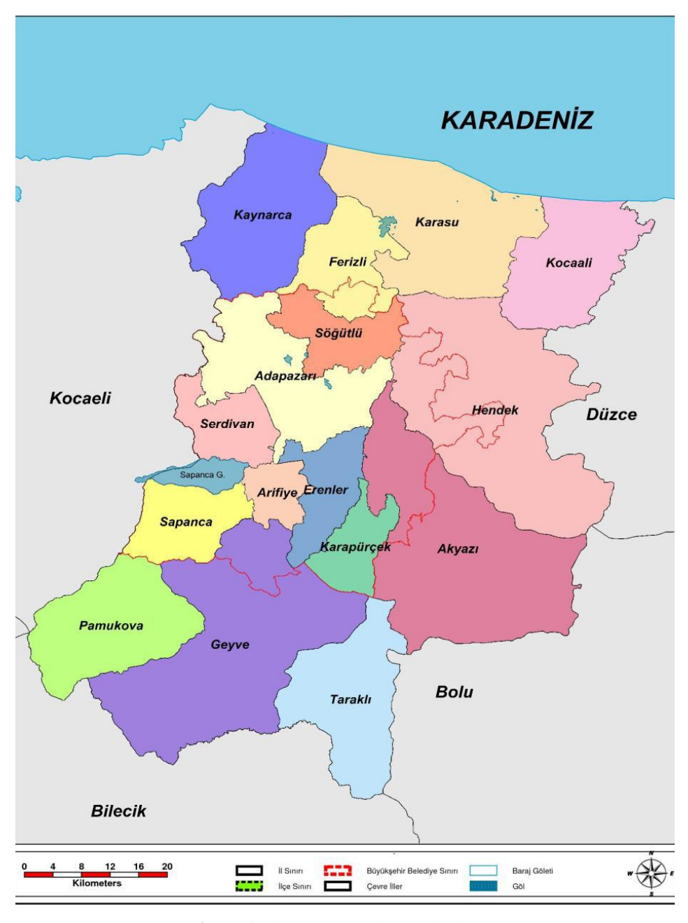
Figure 1. The Location of City of Sakarya

According to the data available for the year 2011, the total population in the city is 888,556. 75 per cent of this population lives the city and district centres. The number of inhabitants per square kilometre is given as 184 people by the same data.