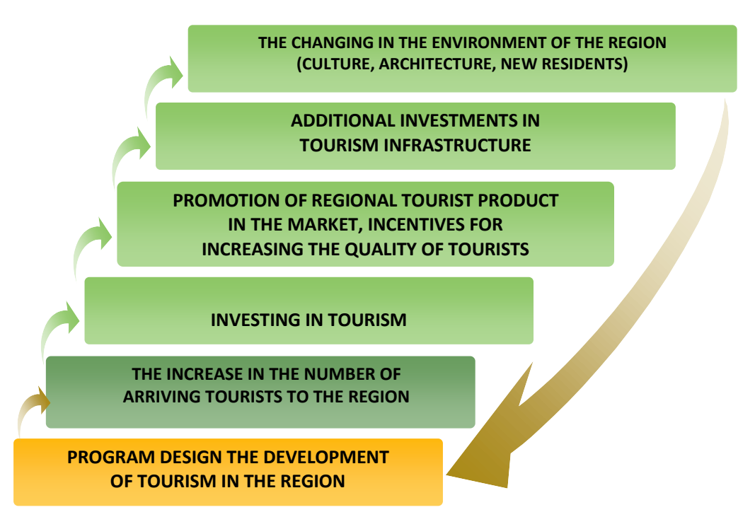
Figure 2. The cycle of development of tourism in the region (Mescon, Albert, Khedouri)