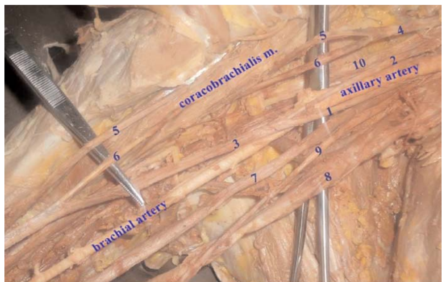
Figure 2. Right axilla and arm showing the coracobrachialis muscle pierced by two nerves, formation of the median nerve, and the union of an additional nerve to the median nerve distal to the muscle. 1: medial root of median nerve; 2: lateral root of median nerve; 3: median nerve; 4: common trunk for the musculocutaneous and unnamed nerves; 5: musculocutaneous nerve; 6: unnamed nerve; 7: ulnar nerve; 8: basilic vein; 9: medial cutaneous nerve of the arm; 10: posterior cord of the brachial plexus. [Color figure can be viewed in the online issue, which is available at www.anatomy.org.tr ]

Analysing our case in for these classifications, however, we found no communication between the musculocutaneous and median nerves; this coincides with Type 1 of