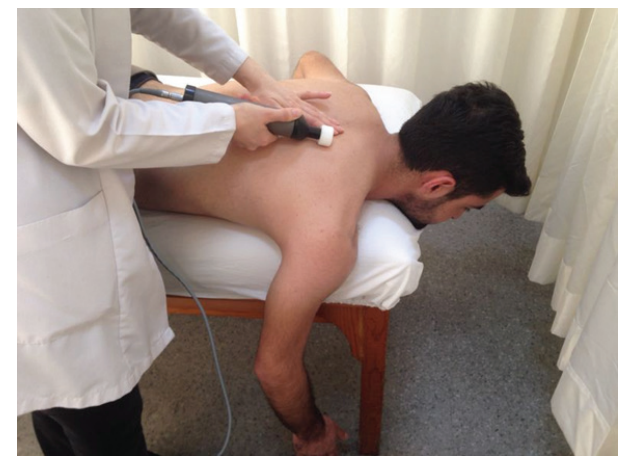
Figure 2: The application of MRT over scapular muscles

MRT (MaRhyThe1 Applikator&Steuer-gerat, MaRhyThe1 Systems GmbH, Grobenzell, Germany) was applied by the same physical therapist who participated in the training program on MRT and was certificated. It was applied over 45 minutes starting from shoulder girdle and including scapula and pectoralis major. Patients were in the supine position and MRT was applied around the scapular muscles (trapezius, latissimus dorsi and serratus anterior) and supraspinatus for 15 minutes. Then the patients were given prone position and MRT was applied around pectoralis muscles. Finally for the remaining 15 minutes, MRT was applied on deltoids, biceps and triceps muscles. The MRT was applied parallel to the fibers of muscle groups (Figure 2). The patients received treatment at the clinic, 3 times a week (totaling 18 sessions).