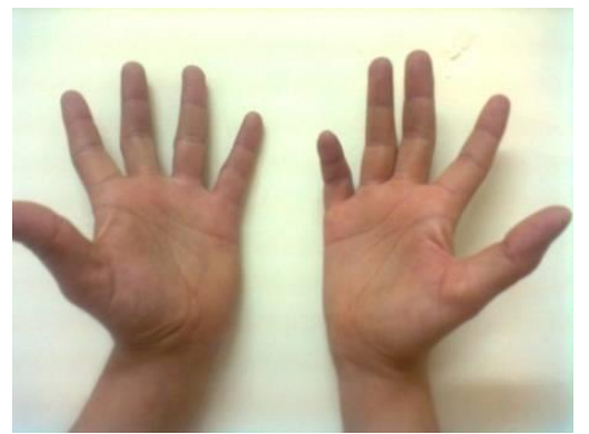
Figure1: Right hand hypothenary atrophy, thumb flexion status in 5th, 4th and 3rd fingers (pre op.)