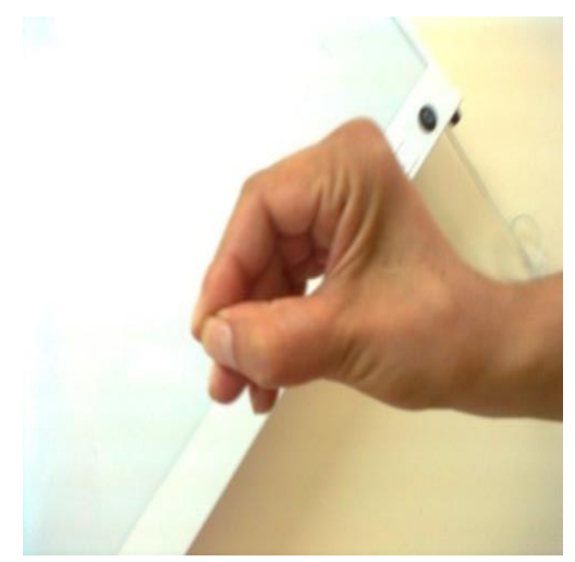
Figure 2: Froment sign; Hyperflexion of the in the holding, catching position (pre op.).