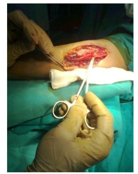
Figure 4: Intro op final state of cubital tunnelat and ulnar nerve at decompression

Only ulnar nerve decompression was performed during the initial surgical intervention (Figure 3 and 4)