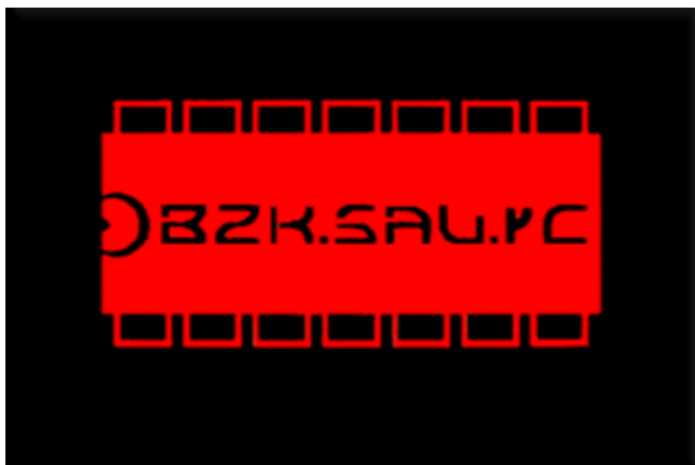
Fig 4. BZK.SAU.FPGA uC login screen

First to talk about the working principle of stepper motor would be appropriate. As is known, stepping motors acts with the trigger certain degrees extent. This movement is necessary to ensure that being the particular value of frequency. There are various ways of achieving this. One of them the help of an electronic circuit needed the frequency value in is to trigger. Another is made by the system that will ensure that you move with the logical gate structure. The stepping motor used in this system to enable movement of the BZK.SAU.FPGA microcomputer architecture conceptual changes are added. A stepper motor for movement of the other process is to form the required electronic circuit. This electronic circuit is ensured thanks to the engines mobility.