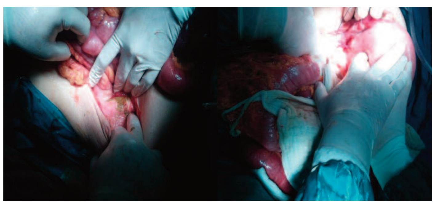
Figure 2. Intraoperative exploration and the repair of uterine rupture.

Eur Res J 2017;3(2):196-199 Kahyaoglu et al