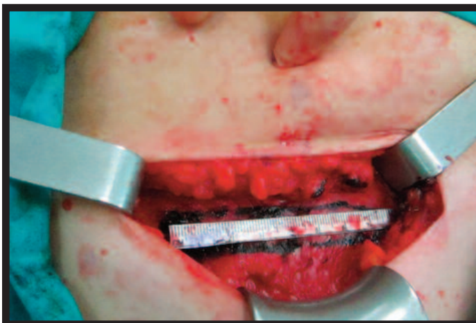
Figure 1. Rectus fascia was marked for to have a graft of 8 cm x 2 cm