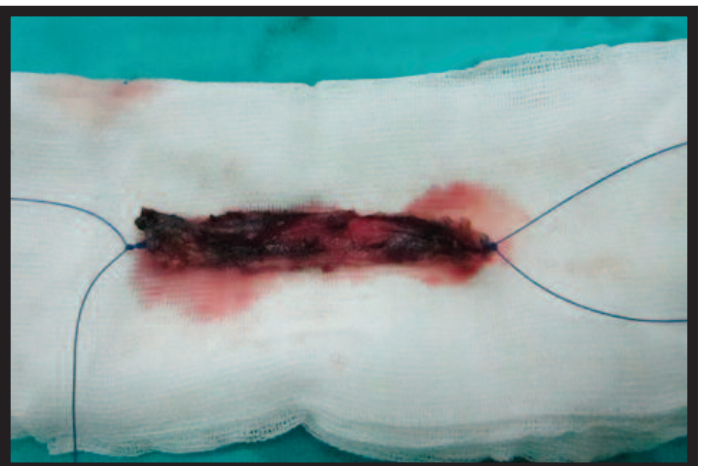
Figure 2. Fixation sutures were passed through both ends of the graft with 1-0 PDS.