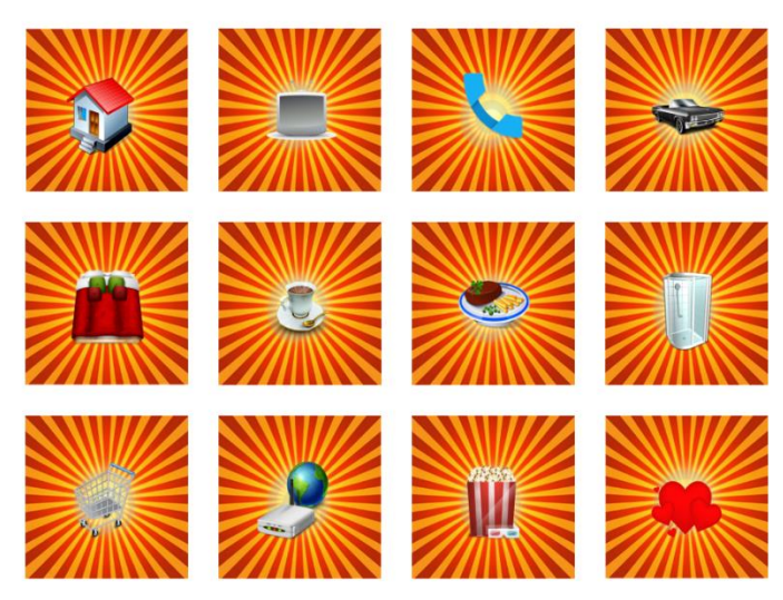
Figure 1. Images shown in the experimental scenario.

using developed BCI. In P3 paradigm each flash lasts 200 ms (d_{flash}) and in course of next 100 ms (d_{non-flash}) no images flash.