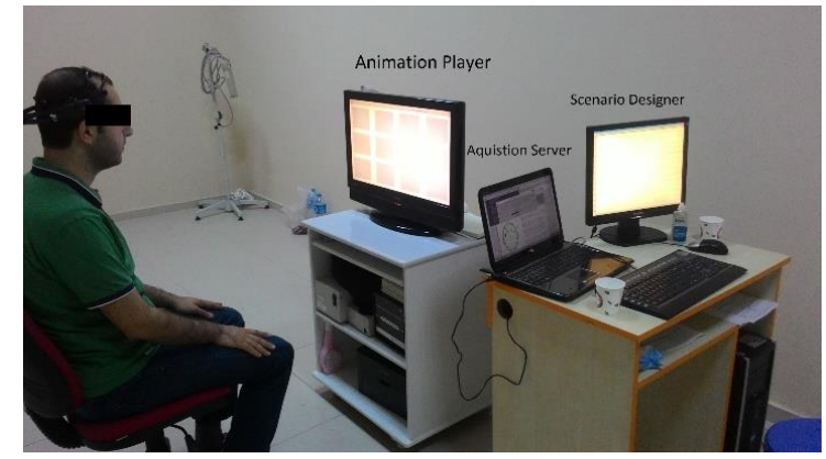
Figure 2. EEG laboratory layout.

The images flashes block-randomly to avoid double flashings, one by one (Fazel-Rezai, 2007). So interstimulus interval is 300 ms. EEG laboratory layout is shown in Figure 2. Signal processing and machine learning algorithms are implemented in MATLAB EEGLab toolbox (Delorme & Makeig, 2004) and WEKA data mining tool (Hall et al., 2009).