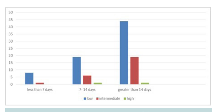
Figure 1. A chart showing the distribution of the 4T test score among gender

In 29 patients who had intermediate and high-risk probability for HIT, mean starting day of HIT was 6,24±3,68 days; mean withdrawal day of heparin was 9,55±5,86 days and mean delay of heparin withdrawal was 3,31±3,39 days. Distribution of delays of heparin withdrawal in 29 patients was shown in Figure 3.