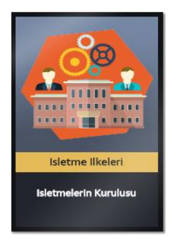
Figure 3. Sample question card

a unit, the unit title and the course name can be seen on the cards, an example of which can be seen in Figure 3.