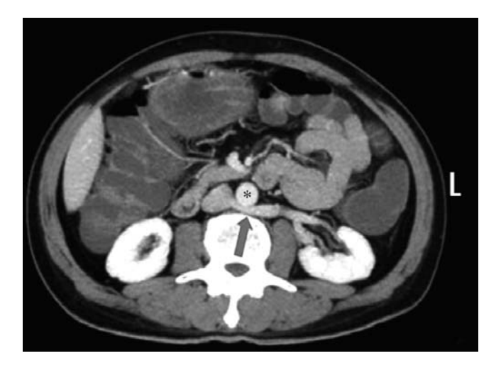
Figure 2. Axial CT image shows a retro-aortic left renal vein ( arrow ). *: Abdominal aorta.

Accessory renal artery is a frequently encountered variation which occurs in 20-30% of the population.<sup>[7]</sup> It may not be clinically significant when it is without any accompanying variation. However, when it occurs with other variations, the incidence in population is lower and