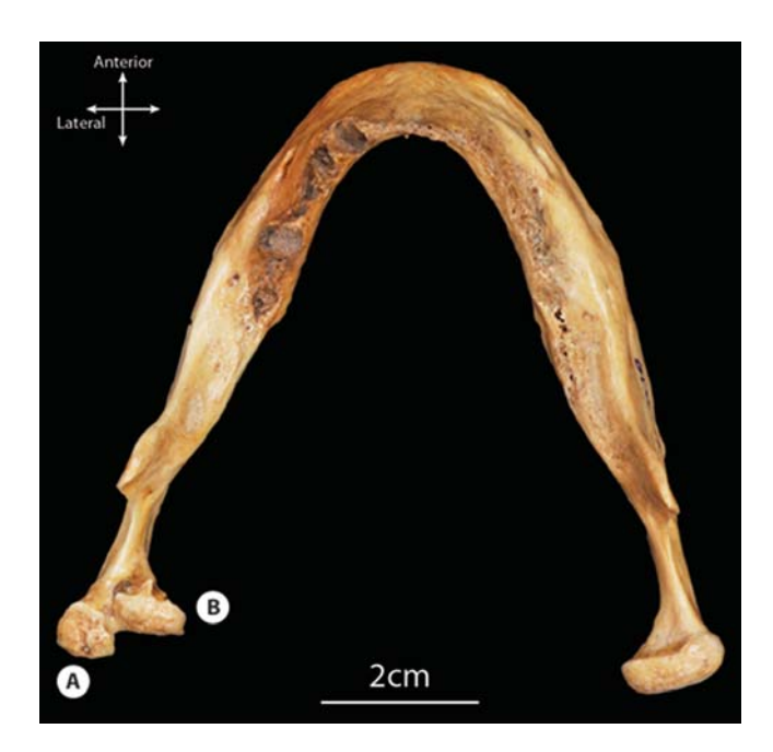
Figure 3. Superior view of the mandible showing the posterolateral (A) and anteromedial (B) condyles on the left part of the mandible with normal condyles on the right.