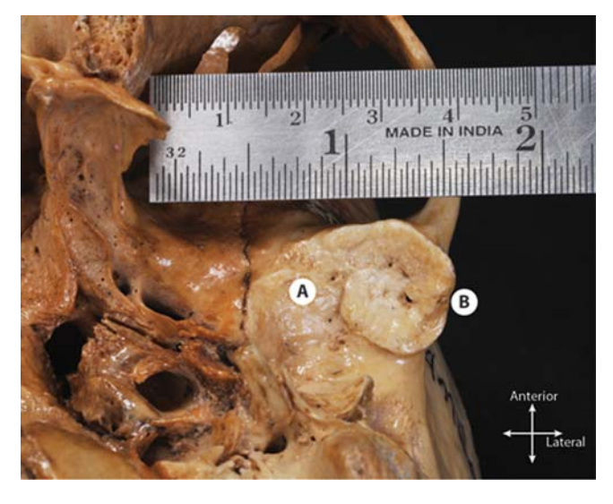
Figure 5. Photograph of the left mandibular fossa region showing two distinct fossae that are present in medial ( A ) and lateral ( B ) locations.

Two distinct medial and lateral fossae, separated by a distinct ridge, were noted in the region of the left mandibular fossa ( Figure 5 ). The lateral fossa was situated more posteriorly than the medial fossa. The morphology and anatomical location suggest that the pos-