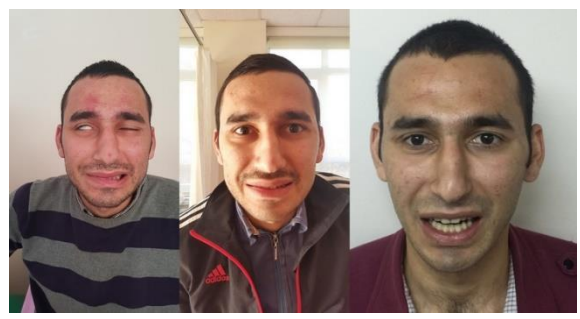
Figure 5: The improvements in the smiling with showing the teeth