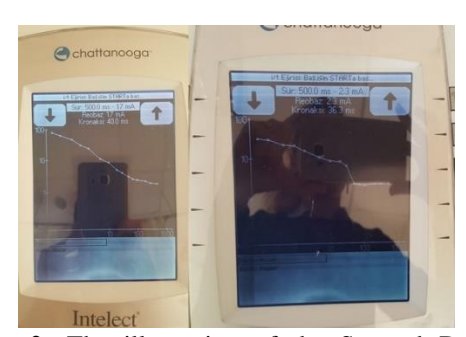
Figure 2: The illustration of the Strength-Duration Curve

movements of the eyebrows with cervical motion. Both nasolabial fold was weak. After initial neurological examination, his electrodiagnostic testing was done by the therapist through the diagnostic charachteristics Chattanooga Intelect Advanced Combo. The Strength-Duration Curve (SDC) was taken to the type of nerve injury (Friedli and Meyer, 1984). The results showed sign of axonal degeneration. The reobase and chronaxie values were 1.7 mA and 40ms (Fig. 2). The photography of voluntary facial expressions was taken. The patient was informed that these photographs could be used clearly in this report. The patient was evaluated three times (before treatment, after treatment and at follow up period of 3 months later). Because the patient lived in a different city, the 3rd evaluation was based on photographs, so results of SDC are missing. A different physiotherapist evaluates the patient to prevent bias.