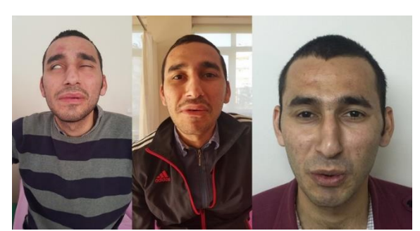
Figure 4: The improvements in the pursing lip