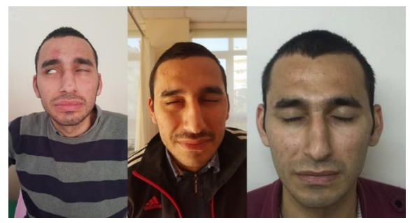
Figure 3: The improvements in the closing eyes

could initiate facial expression. However, the movements in the right hemifacial could not be completed at the end of the therapy. The some of the left hemifacial muscles, corrigator supercilii and frontalis, got the resistance. His right orbicularis oris was more effective to purse lip. Both nasolabial fold was distinct. He could close the eyes and the closure of the left eye was stronger than the right one. The left frontalis could contract efficient, whereas the right frontalis was inefficient, only the contraction was taken. The frowning of the eyebrows was visible (Fig. 3-7).