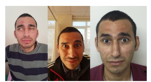
Figure 7: The improvements in the raising the eyebrows

The last evaluation which is at the follow-up period, 3 months after the treatment, was done on the photography (Fig. 3-8). His HB grading progressed to grade II. He could close his eyes without the need of maximum effort. He could frown and raise the eyebrows symmetrically. He could smile while he shows teeths. He could purse lip in the middle line. His resting facial symmetry and coordination between face muscles was exellent (Fig. 8).