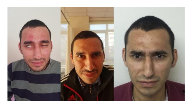
Figure 6: The improvements in the frowning the eyebrows