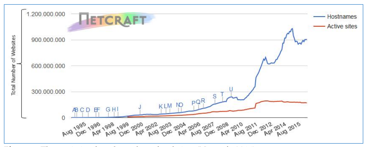
Figure 1. The statistic of total number of websites (Netcraft, 2016).

Web, which was born in Tim Berners Lee's lead (Veen, 2000) in 1989, still can be defined as a technological product which users benefit the most on reaching information nowadays. This technology which is at the age of twenty-seven continues its development process. At the present time, this growth can be seen more clearly thanks to the number of websites (Figure 1).