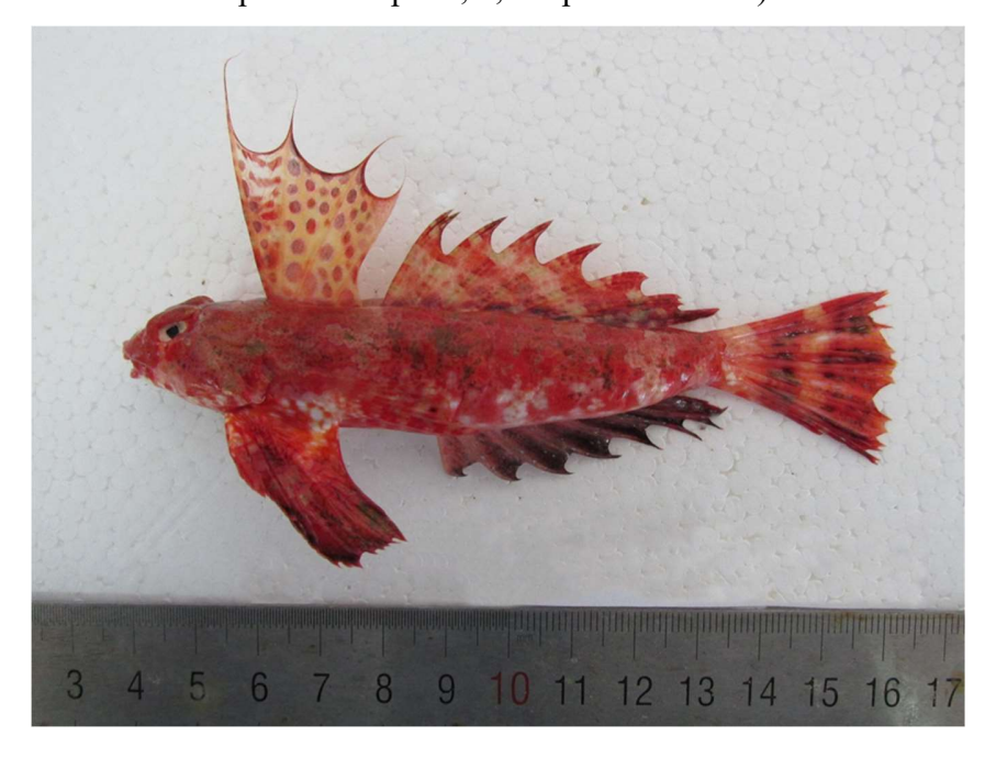
Figure 2. The female specimen of Synchiropus sechellensis (Standart length 105 mm) from Aydıncık, Turkey.