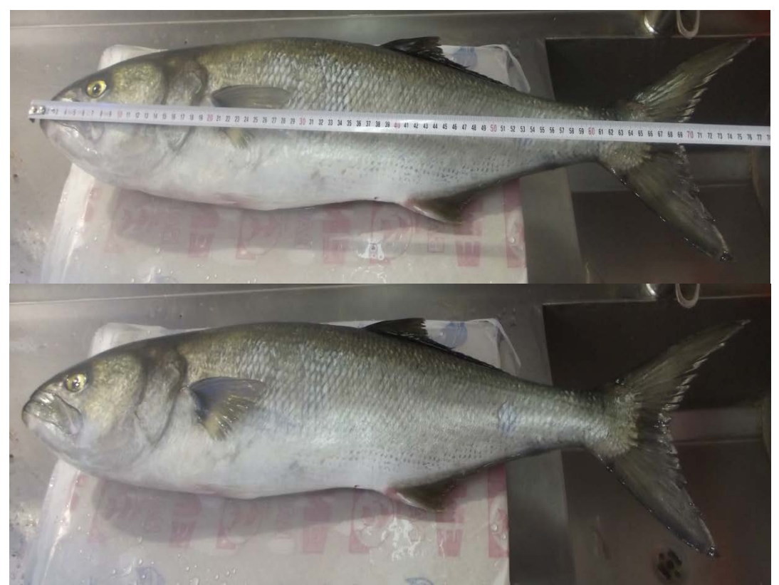
Figure 1. Pomatomus saltatrix with 76.5 cm TL and 4800.0 g TW.

On 10 September 2013, the one specimen of the bluefish ( Pomatomus saltatrix Linnaeus, 1766) with 76.5 cm in total length (TL) and 4800.0 g in total weight (TW) (Figure 1) was photographed in the Çanakkale Fish Market (Figure 2). The scientific name of the species was also checked against FishBase [17].