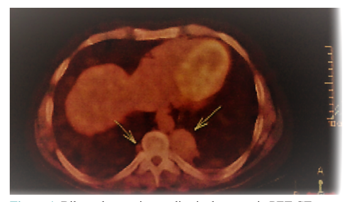
Figure 1. Bilateral posterior mediastinal masses in PET-CT scans