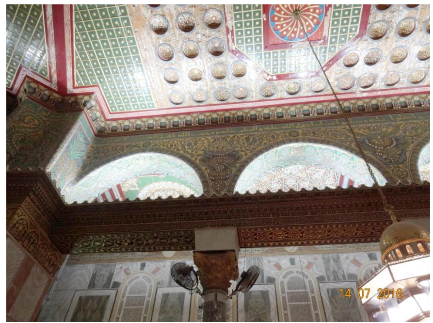
Figure 5. Interior, Mosaic Ornaments and Ceiling