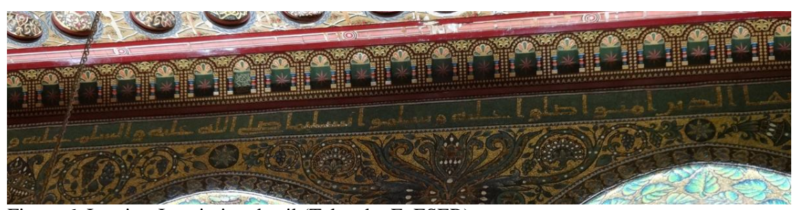
Figure 6. Interior, Inscription detail