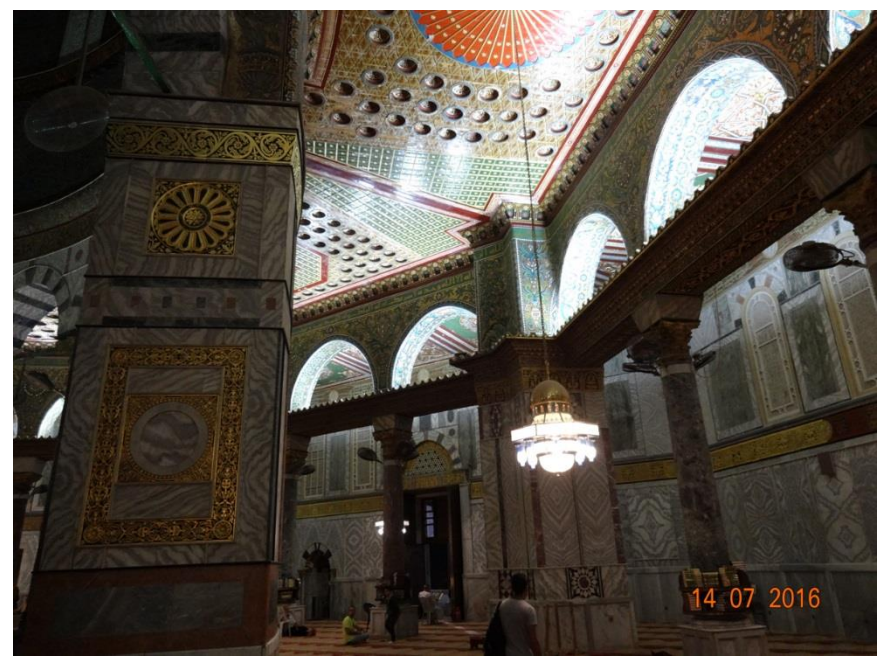
Figure 4. Interior, Marble and Mosaic Ornaments