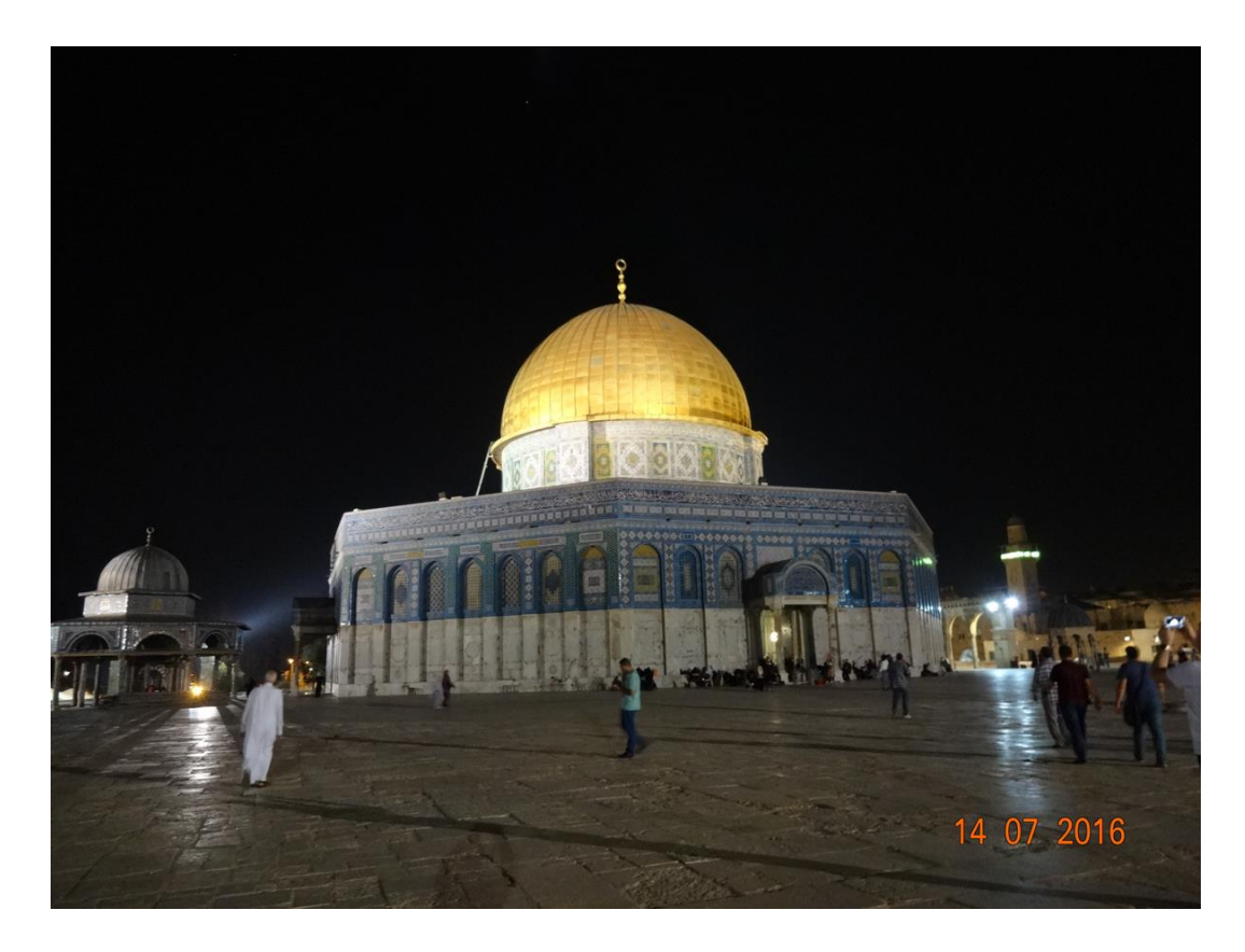
Figure 1. The Dome of the Rock, General view from the West