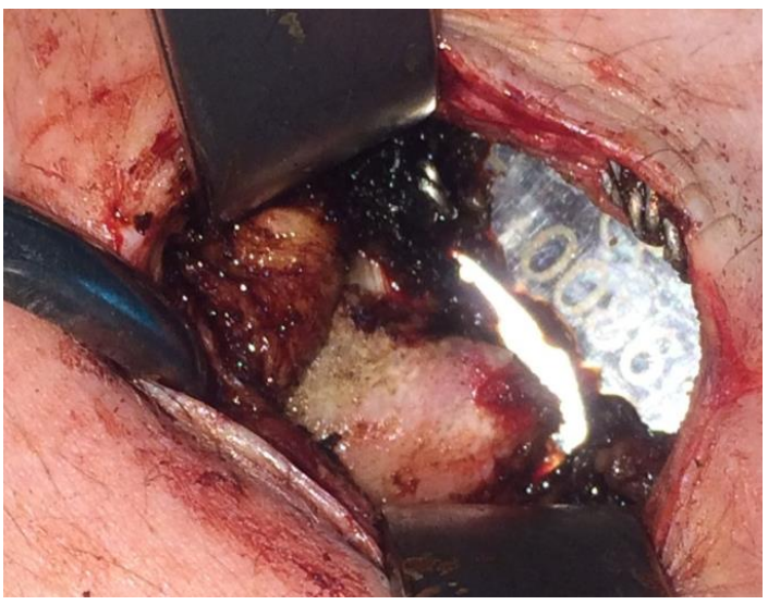
Figure 2: Intraoperation image of ossification

There are numerous publications in the literature suggesting that new bone development may occur around the implants due to trauma. In most cases, the implant is placed near the surface or the periost. This ossification is also an advantage in fixing the instrument [5,9]. While new bone development may be seen on the bar tips, some patients may develop a more aggressive ossification and ossification may also even be seen on the whole bar. This might also prevent the access to the bar [5]. In one case (No. 5) in our study, we could only reach the bar with scopy due to the density of the ossification (Figure 2). We established that patients whom we placed the bar SM developed a denser ossification.