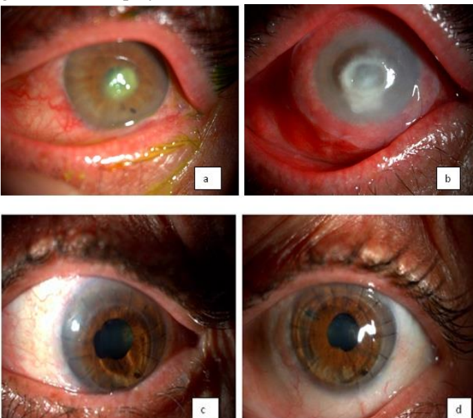
Figure 3. Figures of case 2 (a) First day after trauma and before treatment, (b) 4 days after topical, intracameral voriconazole treatment, and AMT, before TPKP, (c) 1 month after TPKP, (d) 11 months after TPKP (AMT: Amniotic membrane transplantation, TPKP: Therapeutic penetrating keratoplasty)

63 years-old male patient came to the clinic with the complaint that a walnut fell on his left eye a day before. VA was 0.03 in the left eye. IOP was normal digitally. In the central left eye cornea, there was infiltrative lesion, corneal thinning, and hypopyon (Figure 3a). Posterior segment was normal on ultrasound examination. Fungal was positive in direct microscopic examination, but no growth was displayed in culture.