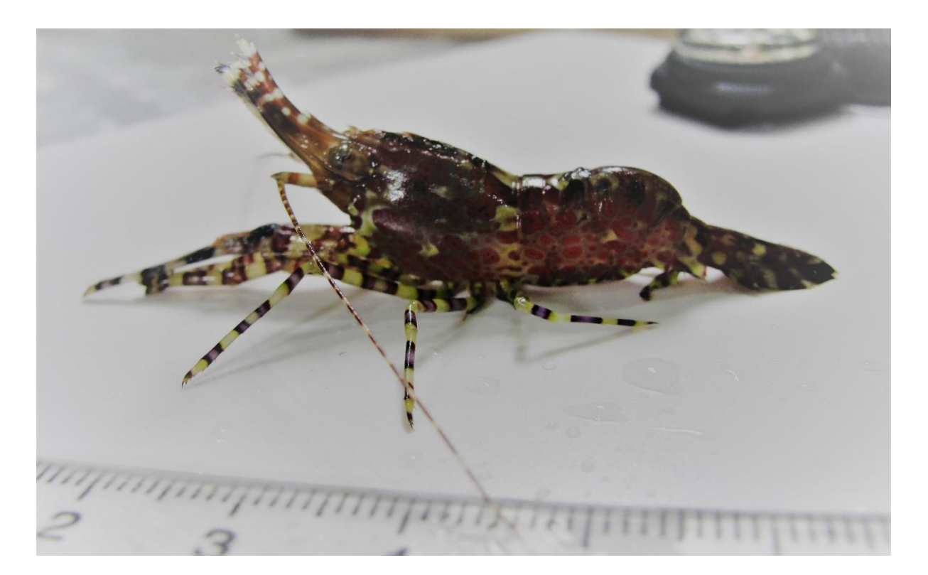
Figure 2. Saron marmoratus (Olivier, 1811) collected from Çevlik coast, eastern Mediterranean, Turkey

photographed (Fig. 2). Meristic measurements and diagnostic features were determined according to previous studies (Rothman et al., 2013; Poupin & Juncker, 2010; Baby et al. 2016).