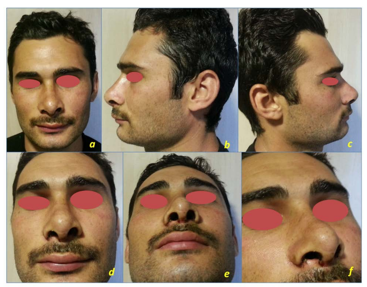
Figure 2. Postoperative anterior (a), left (b), right (c), antero-inferior (d), inferior (e) and right-inferolateral (f) photographic views of a male patient.

operations. The most important variable in the nasal airflow is the diameter of nasal passage. The interaction of static and dynamic forces, including the nasal septum, turbinates, lateral nasal walls, and nasal mucosa interacts during normal nasal breathing [19]. Kern and Wang [20] classified the etiologies of nasal dysfunction valve as mucocutaneous and skeletal/structural disorders. Secondary to infectious, allergic or vasomotor rhinitis the cross-sectional area of the nasal valve may decrease due to mucosal swelling, and it may reduce nasal airway patency. The skeletal/structural components of nasal valve (septum, upper and lower lateral cartilages, fibroareolar lateral tissue, piriform aperture, head of the inferior turbinate, and nasal floor) may also contribute to lateral nasal valve collapse during inspiratory activity especially at sport activities.