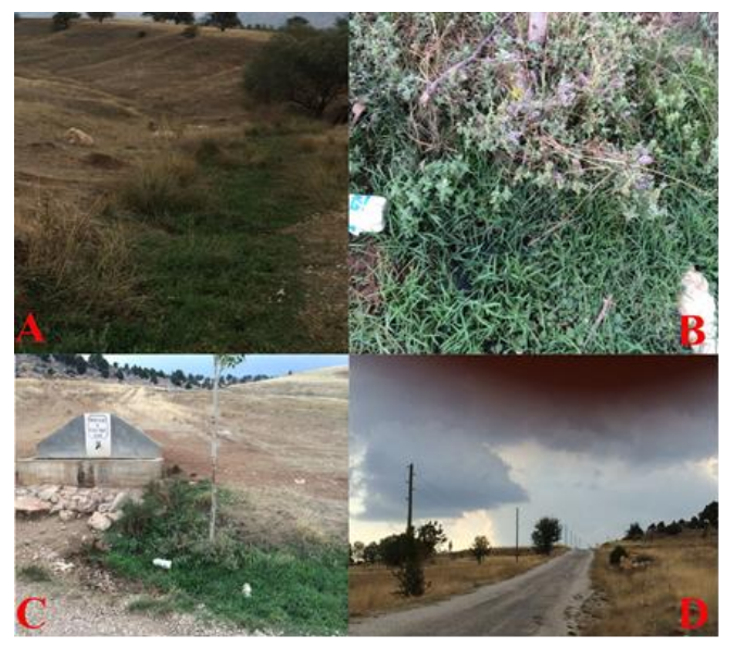
Figure 1. The habiat of the Atlıdere locality A-General view of the right side of the road B- General view of the left side of the road C- View of the habitat where the specimens were found D- Flora of the habitat.

The habitat of R. tavasensis is covered by the members of Mentha and Jungus genus and representative of the Poaceae family (Fig. 1B). The ground surface is usually wet due to water fountain nearby. The habitat of Tavas frog is far away from human settlements and characterized as stepped (Fig.1C, D).