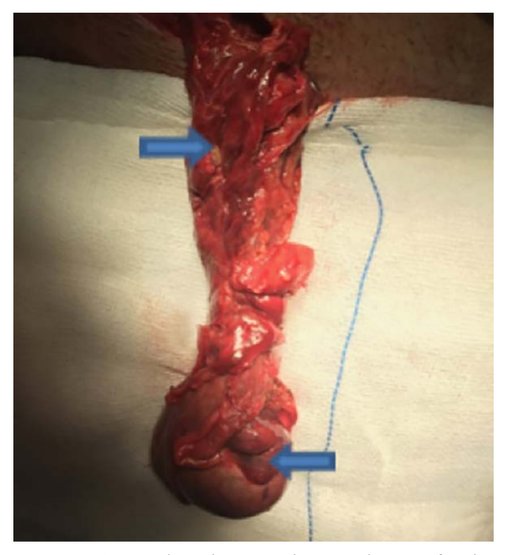
Figure 2. Arrows shows intraoperative necrotic parts of testis and spermatic cord.