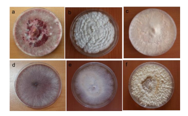
Figure. 2. Fusarium spp. on PDA, (a) F. graminearum, (b) F. chlamydosporum, (c) F. nivale, (d) F. culmorum, (e) F. tricinctum, (f) F. equiseti