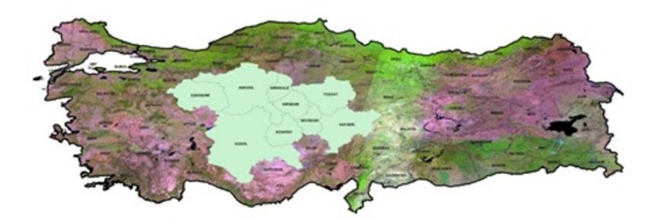
Figure 1. Location of survey area in Central Anatolia Region

Surveys were conducted in Konya, Ankara, Eskisehir, Kayseri, Nevsehir, Aksaray, Yozgat, Kirsehir and Kirikkale province in 2011 and 2012 growing seasons in Central Anatolia Region, Turkey (Figure 1). 1256 diseased wheat samples were collected from 2770 wheat fields.