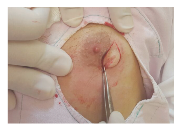
Figure 1. Excision of the subcutaneous nodular lesion adjacent to the left nimple

On cut surface, dermal, mucinous appearance was determined. Histopathological examination revealed poorly circumscribed, partially lobulated dermal myxoid collection (Figure 2a). The lesion was hypocellular and consisted of few spindle cells, vasculary structures and fibrous septae. No mitosis was observed. In between myxoid stroma, sparse breast ducts and muscles were present (Figure 2b–d). The mucin stained positively with Alcian blue stain at pH 2.5 (Figure 2e). Immunohistologically, the lesion was negative for pancytokeratin and S100, but sparsely positive for smooth muscle actin (SMA) and relatively diffuse for CD34 (Figure 2f). A diagnosis of NM of the breast was made upon clinicopathological findings.