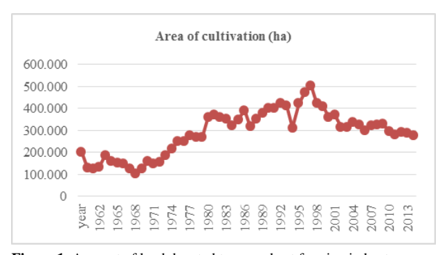
Figure 1. Amount of land devoted to sugar beet farming in hectares

The total production on the other hand was 4.4 million tonnes in 1960 which rose to 16.5 million tonnes in 2015 with 2.75 times increase as can be understood from Figure 2. This signs to a rise in the yield as expected, when the declination of land is considered with the rise in production. The yield per hectare rose from 21.61 tonnes per hectare in 1960 to 59.8 tonnes per hectare with 1.76 times in 2015. Besides, the average between these years was 11 million tonnes and this figure refers to the steady rise after 1980s.