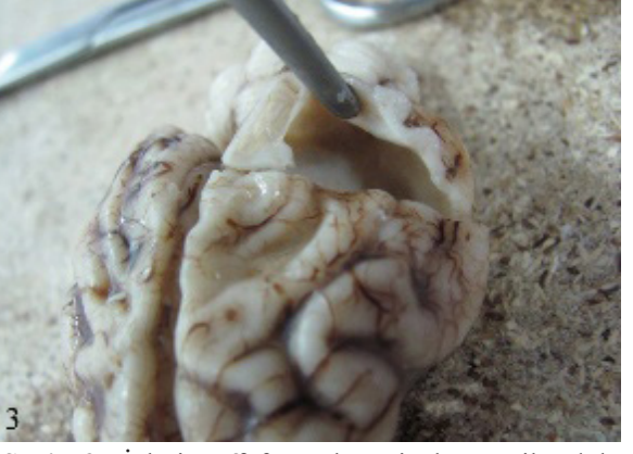
Sekil 3. İçleri şeffaf serebrospinal sıvı ile dolu kavitasyonlar. Fig 3. The cavities were filled with clear cerebrospinal fluid.

Copper is an essential trace element and is found in at least 10 enzymes which catalyze oxidation reactions in plants and animals. It is one of the most important elements necessary for the development of the embryo and fetus. Its deficiency in pregnant animals results in deficiency in the fetus as well. Thus, enzootic ataxia occurs in babies born from sheep fed on