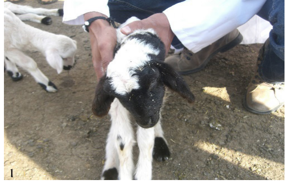
Şekil 1. Kuzu, klinik bulgu; baş öne eğik, ayakta durmada güçlük.

difficulty in standing, blindness, inability to stand, sitting on back legs (dog sitting position), and ataxia were observed (Figure 1). Macroscopically, there were cavities filled with clear cerebrospinal