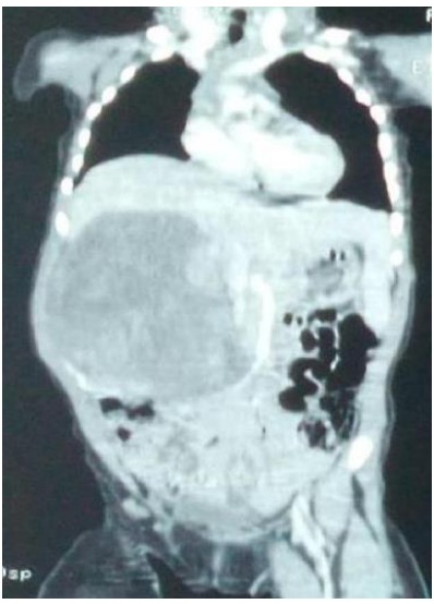
Figure 1: Computed tomography appearance of a bulky abdominal mass, unencapsulated, heterogeneous density and whose relationships with the kidney are imprecise

Pulmonary, cerebral and bone extension assessment did not indicate secondary localization. Preoperative chemotherapy was administered according to GFA-Nephro 2005, with no toxicity 0. At the end of preoperative chemotherapy, abdominopelvic CT showed no reduction in tumor volume. Surgery consisted of an extended right anterior trans-peritoneal nephro-uretectomy with lymph node dissection was performed. The operative piece measured 15x10x 9cm. The ureter measures 3x0.5 cm. At the opening, the entire kidney is occupied by a beige tumor, homogeneous, massively infiltrating the kidney and having cystic areas. Histologically, there was tumor proliferation arranged in layers. It is made of cells sometimes rounded, sometimes oval or fusiform. The nuclei are small, with fine chromatin. These cells are located on an abundant myxoid background with formation of cystic foci bordered by tumor cells. The tumor stroma has vessels and fine-walled capillaries, absence of anaplasia, heterologous component or nephrogenic residue with negative cleansing (latero-cellar + inter-aorticcellar). Tumor cells diffuse vimentin and cyclin D1 and do not express BCL2 or desmin (Figure 2). Histological and immunehistochemical appearance compatible with a clear cell sarcoma, classified according to the SIOP (International Society of Pediatric Oncology) 2001 high risk, stage II.