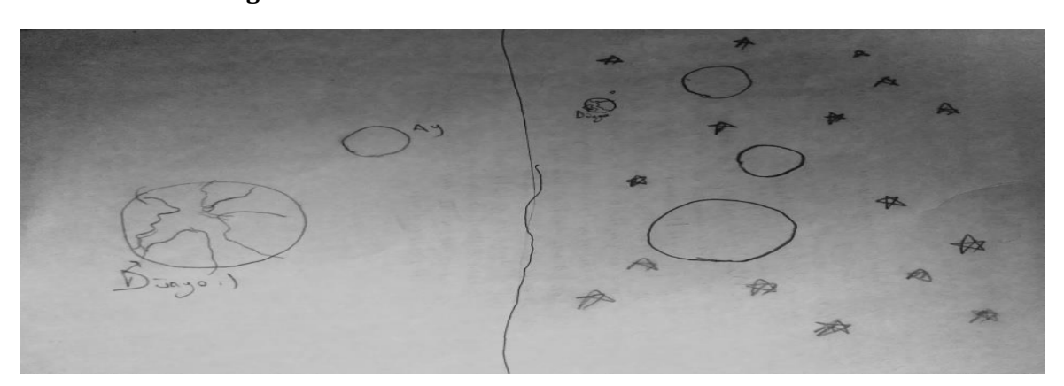
Figure 3. Strict Line between Earth-Moon and Universe.

One extroverted participant sees this experience as a bigger worldview, after strict line the world and moon perspective expanding to universe so his view expanding his horizon after the placement of psychology department (See, Figure 3.).