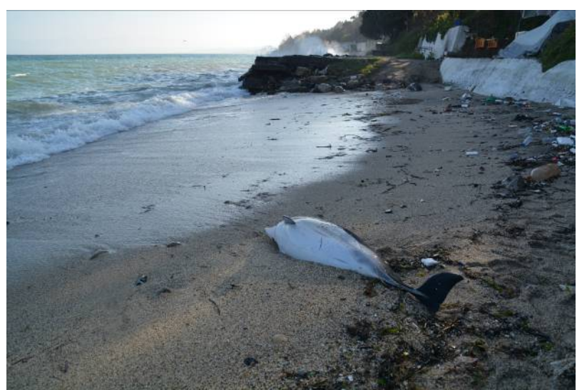
Figure 4. Common dolphin found in Bahçeler coast location on March 31, 2018 (no: 2)