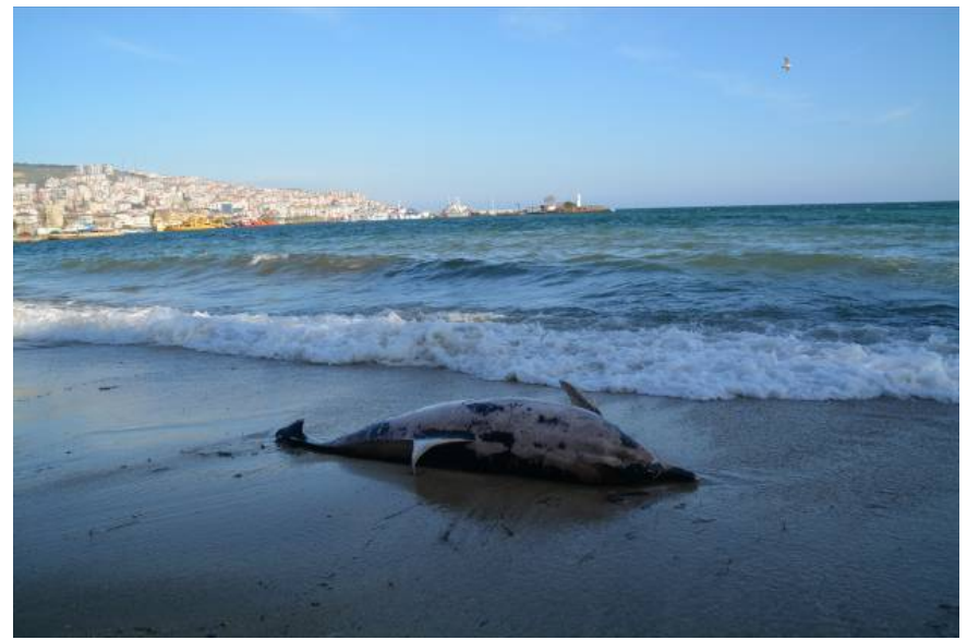
Figure 5. Common dolphin found in Bahçeler coast location on March 31, 2018 (no: 3)