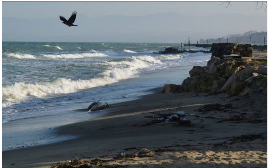
Figure 7. Common dolphin found in DSI location on March 31, 2018 (no: 5)