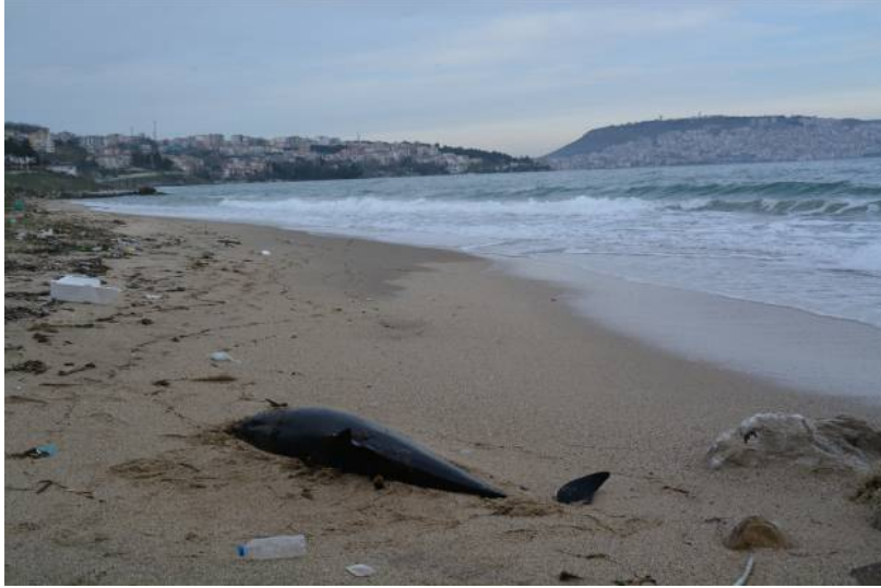
Figure 9. Common dolphin found in state hydraulic works (DSİ) coast location on April 1, 2018 (no: 7)

Of three Cetaceans in the Black Sea, D. delphis was the only determined by-caught species. Among 10 specimens of D. delphis found stranding in this study, seven individuals were male. Cetacean species were caught as an incidental catch in the fishing nets especially the turbot gill nets which are the most dangerous for the cetaceans in the Black Sea (Radu et al. 2003). Cetacean by-catch in the turbot gill net fishery was reported for the western coast of Turkish Black Sea (Öztürk et al. 1999; Tonay and Öztürk 2003; Tonay 2016; Özdemir et al. 2017). In the present study, it was determined that a lot of water birds species ( Great cormorant ) were shown as died on the sea coast during the dolphin survey on March 31, 2018. Furthermore, one D. delphis obtained as gill net wrapped in a tail. The death reasons of the common dolphin were drowned after the catching the nets and it is also suspected that death reason of common dolphins is water pollution. Furthermore, it is clear that other anthropogenic impacts such as habitat degradation, physical modification of the seabed and disturbance catch in fishing gears have further influenced and reduced populations of Black Sea cetaceans (Birkun 2002).