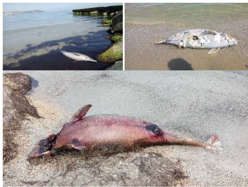
Figure 2. Stranding 3 individuals of common dolphins found in Kiraztepe location on May 1, 2017.