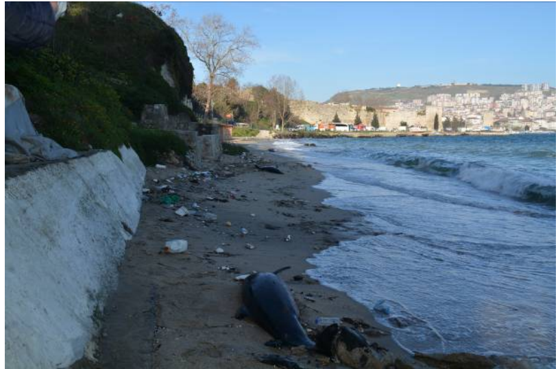
Figure 3. Common dolphin found in Bahçeler coast location on March 31, 2018 (no: 1)