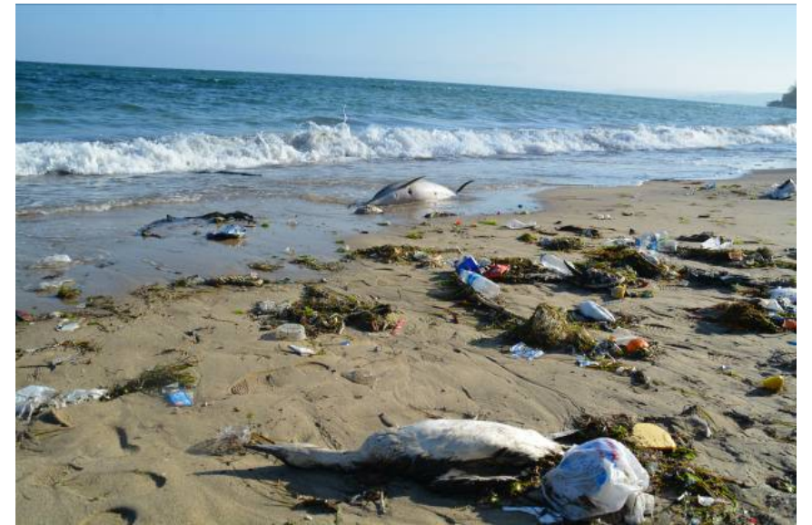
Figure 6. Common dolphin found in Bahçeler coast location on March 31, 2018 (no: 4)