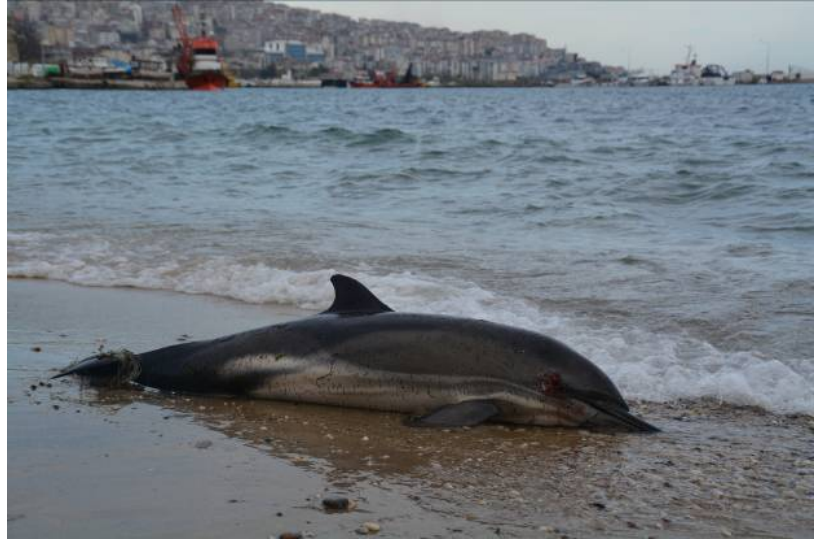
Figure 8. Common dolphin found in Bahçeler coast location on April 1, 2018 (no:6)