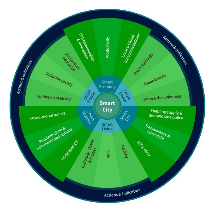
Figure 1. Smart City Wheel.

Dataset structure of cities is based on the six characteristics that defined by Boyd Cohen (2013) in his 'Smart City Wheel' as shown in Figure.1. The smart city wheel is describing the six characteristics with some factors, which can give us a rough direction to define our indicators.