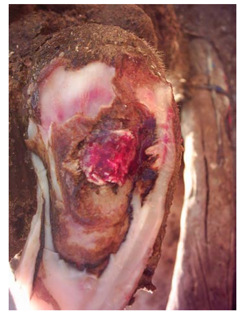
Figure 2. View of ulcus solea on a hoof