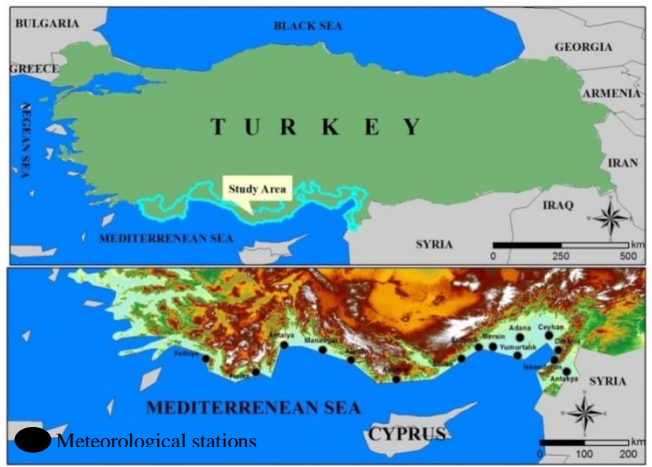
Figure 1. Locations of the study sites (Map of Mediterranean Coast).