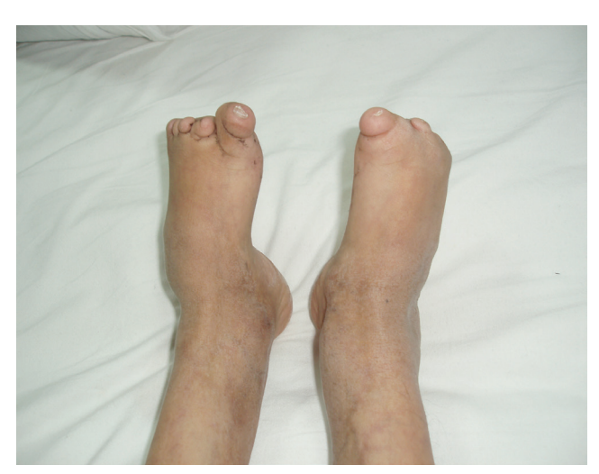
Figure 2. Asymmetric transverse limb reduction defect.