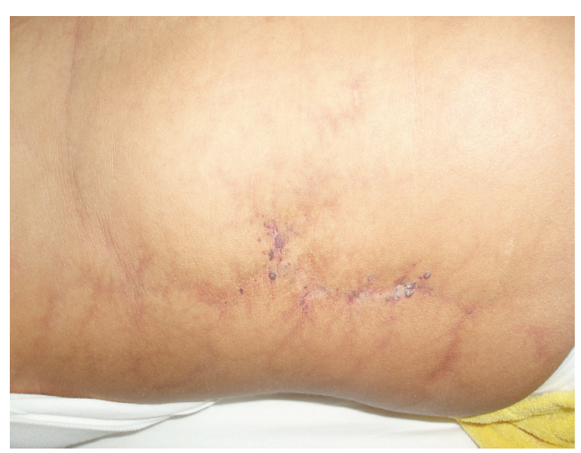
Figure 3. Abdominal skin defect.