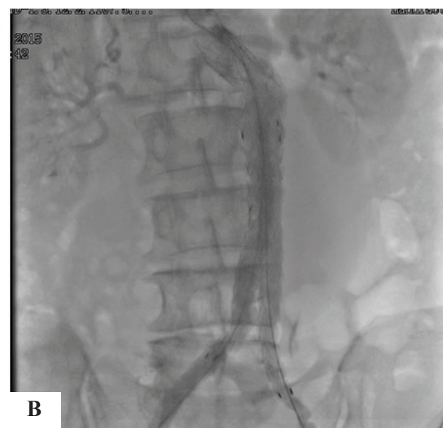
Figure 2. (A, B) Bifurcated stent prosthesis was implanted in the usual manner.