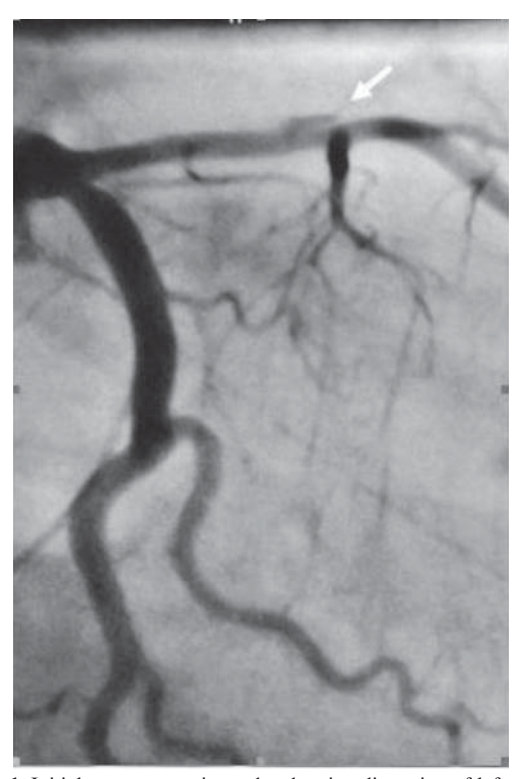
Figure 1. Initial coronary angiography showing dissection of left anterior descending coronary artery (white arrow) without significant reduction of antegrade flow. Left coronary angiogram right anterior oblique caudal