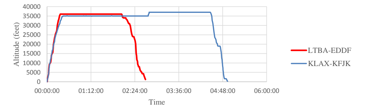
Figure 1. Flight trajectories for LTBA-EDDF and KLAX-KJFK in terms of altitude and time.

Aircraft trajectory data derived from "flight aware" [16] website is examined by planned flight distance, actual flight distance, flight duration and difference between planned and actual flight distance. The maximum (Dist_Max), minimum (Dist_Min) and average (Dist_Ave) variation, which are the values between planned and actual flight distances, are computed. The value of average flight distance is chosen to be analyzed in this study. Flight trajectories belonging to LTBA-EDDF and KLAX-KJFK are presented in Figure 1 and Figure 2.