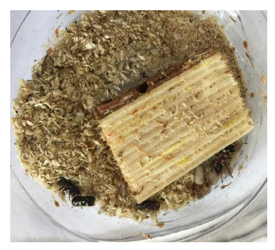
Figure 1. Adult of T. formicarius are fed with I. sexdentatus adult and larvae