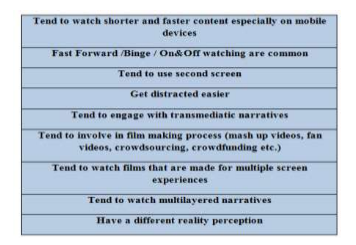
Chart 1: New Audience Patterns

International Journal of Cultural and Social Studies (IntJCSS), December, 2018; 4(2): 365-379