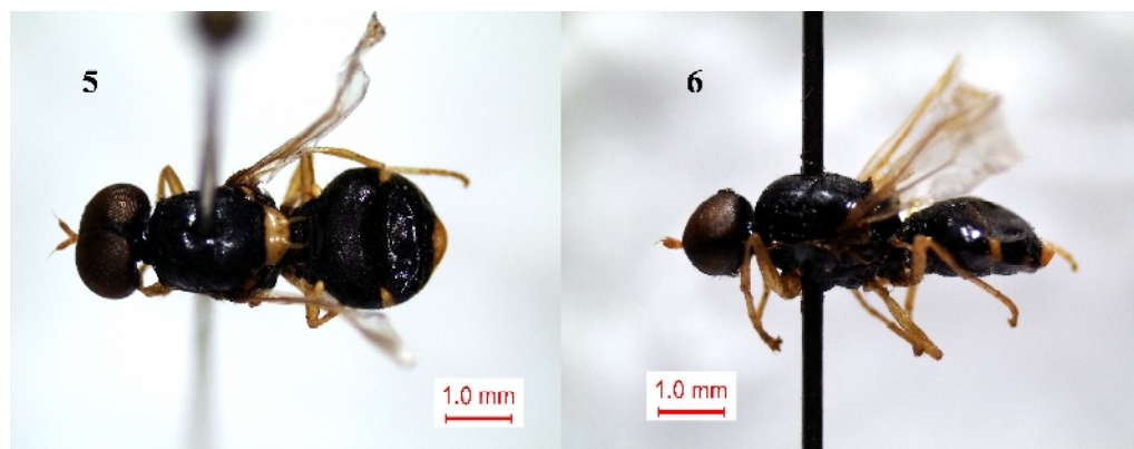
Figures 5–6. Oxycera muscaria : 5. Male in dorsal; 6. Lateral view. Scale bar: 1 mm.

Male (Figs 5-6). Length: body 5.0 mm, wing 4.2 mm. Dark and small species without longitudinal stripes on scutum. Frons and face shining black. Thorax shining black. Small postpronotal callus, postalar callus yellow. Scutellum and scutellar spines yellow, but scutellum narrowly black at base. And Yellow upper margin of anepisternum narrow and hardly expanded in front of wing -base. All legs yellow. Abdomen black with two pairs of oblique yellow lateral stripes.