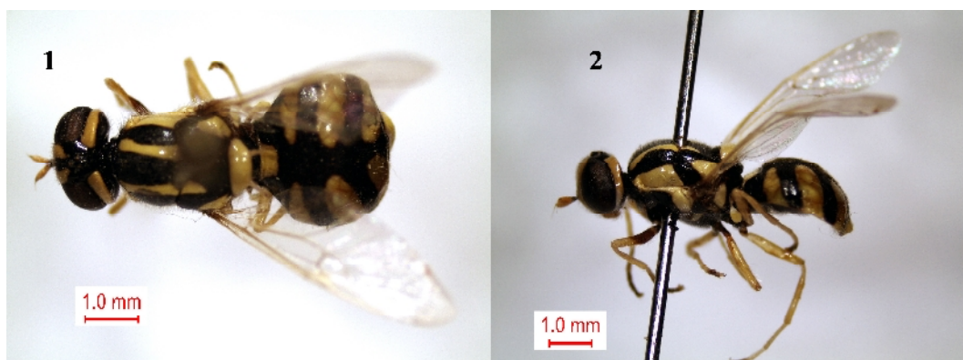
Figures 1–2. Oxycera fallenii : 1. Female in dorsal; 2. Lateral view. Scale bar: 1 mm.

Oxycera fallenii is a typical European species that is distributed from Austria, Czech Republic, Denmark, England, Germany, Ireland, Italy, Poland, Romania, Slovakia, Sweden, Switzerland, eastern Fenoscandia and Ukraine (Karkov) (Dušek & Rozkošný, 1974; Rozkošný, 1980, 1983; Rozkošný & Nartshuk, 1988; Woddley, 2001). Woodley (2001) stated in his World Catalog of the Stratiomyidae that this species is also spread in Russia (although without a precise locality).