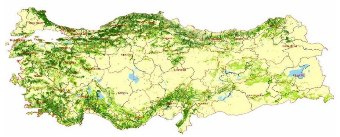
Figure 2. Forest Reserves of Turkey

There are steps taken by the central government to minimize and manage solid waste in cities. For this purpose, "Waste Management Regulation" was published in 2015. Then, a new draft regulation was created in 2018 within the scope of "Zero Waste Project". These steps are expected to have positive consequences for environmental sustainability in the long term. Another important component of evaluating environmental performance is water. The demand for water increased and the water reserves threatened in consequence of population growth, economic development, and rising industrial and agricultural production. According to the State Hydraulic Works (SHW, 2012) Turkey's annual exploitable amount of water has been approximately 1,500 m3 per capita which results her to take place in "insufficient/water stressed" water health countries group. According to the future estimation this value will decrease to 1,000 m3 per capita and the country will be classified in "poor water health" countries group. Turkey is a water scarce country and shows high vulnerability about water governance and footprint (Al-Saidi et al., 2016). Thus, another important criterion for achieving environmental sustainability is drawn water and wastewater management.