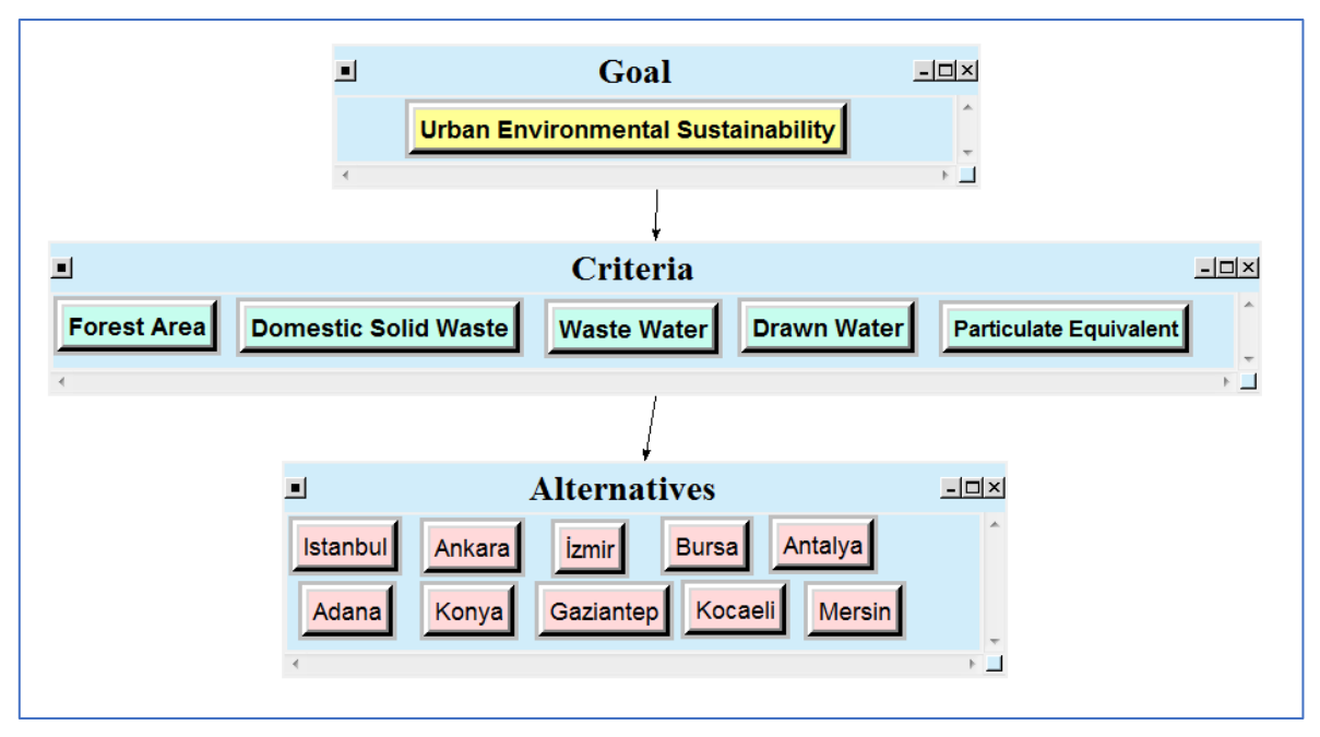
Figure 1: Hierarchy Tree of the Model

Quantitative data were obtained from different governmental sources but mainly from Turkish Statistical Institution (TURKSTAT). The analysis was limited by 2016 since the latest statistics published in 2016. Data cover 10 cities among 81. The population of selected metropolitans represents 49.54% of the total urban population in Turkey. In these cities 65% of GDP was created by the end of 2017 (TURKSTAT, 2019).