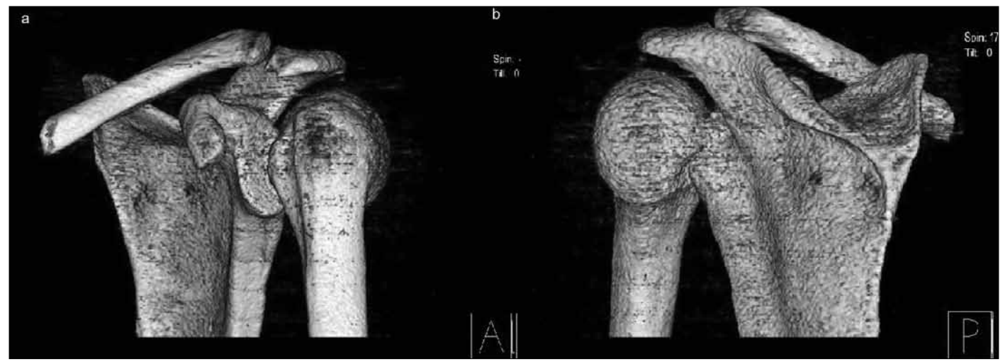
Figure 1. 3D CT shows left shoulder posterior dislocation, 1a anterior view, 1b posterior view

PD of the shoulder remains a diagnostic and therapeutic challenge. It is a rare, difficult to diagnose and commonly missed injury. The diagnosis is frequently delayed or missed, in view of its rarity and paucity of tell-tale physical signs and failure to make adequate radiographs. The risk of missing PD can be minimized by careful physical examination. In these patients before X-Ray CT should be performed to better delineate the anatomy of the fracture dislocation and enable the planning of surgery (7). The standard AP view looks normal or shows only subtle abnormalities. The true AP view is difficult to interpret because there is only subluxation of the shoulder. The axillary lateral view is essential for diagnosis and estimates the size of the anteromedial defect of the humeral head. It may be difficult to obtain because of pain and limitation of abduction (6). As in our case, a clear image on X-Ray could not be performed first; then a CT scan was performed and a clear and significant image was obtained. A CT scan