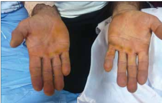
Figure 1. Image taken after 3 days of exposure, which shows the yellow staining of the hands

A 70-year-old man was admitted to the coronary intensive care unit with the diagnosis of subacute ST elevation myocardial infarction. He had chest pain after performing agricultural spraying on the previous day. Past medical history did not reveal previous coronary artery disease but revealed smoking. Physical examination revealed a pulse rate of 79 beats per minute (bpm), systolic blood pressure of 110/75 mmHg, respiratory rate of 18 breaths/min, body temperature of 36.9°C, and no abnormal findings except prominent yellow staining of both hands on admission. Figure 1, a photograph that was taken 3 days after exposure, shows that the yellow staining was still present. ECG showed sinus rhythm, Q waves in anterior leads, and ST elevation indicating subacute anterior myocardial infarction