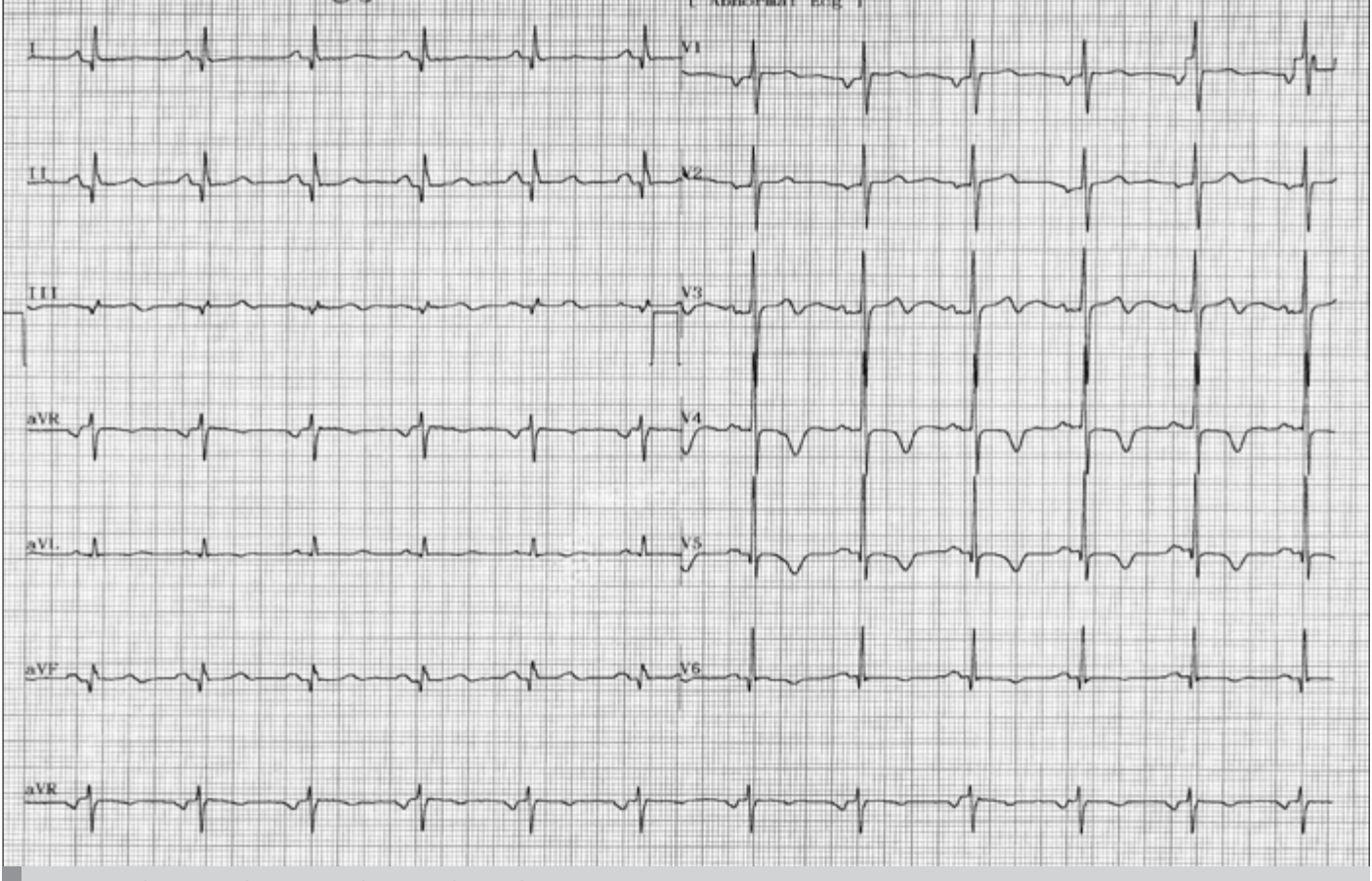
Figure 1. Ischemic ST changes on electrocardiography

Constriction of the coronary arteries occur by release of mediators like histamine, leukotrienes, neutral proteases, and platelet-activating factor locally and to the systemic circulation by degranulation of mast cells which are located in the intimal layer of coronary arteries and