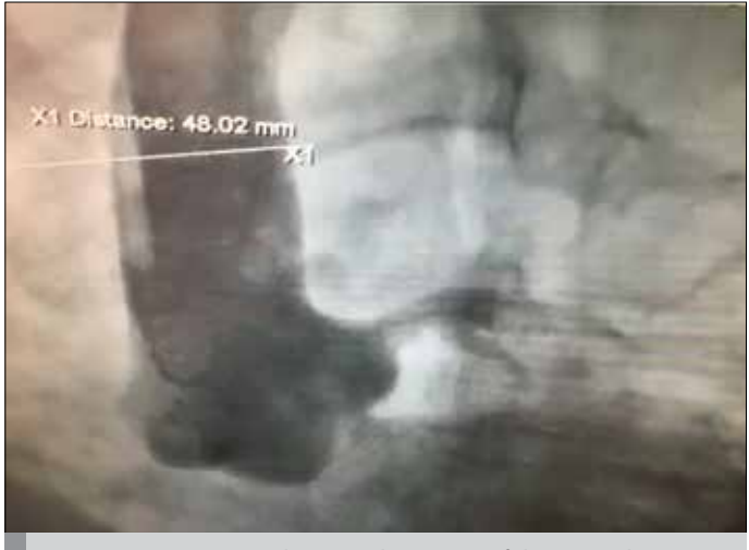
FIGURE 3. Aortagram showing dissection of the ascending aorta