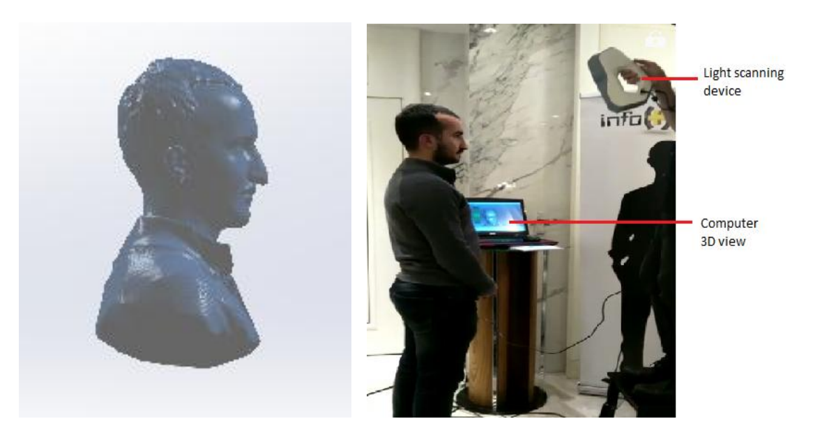
Figure 4.a. Screening process and result, side view