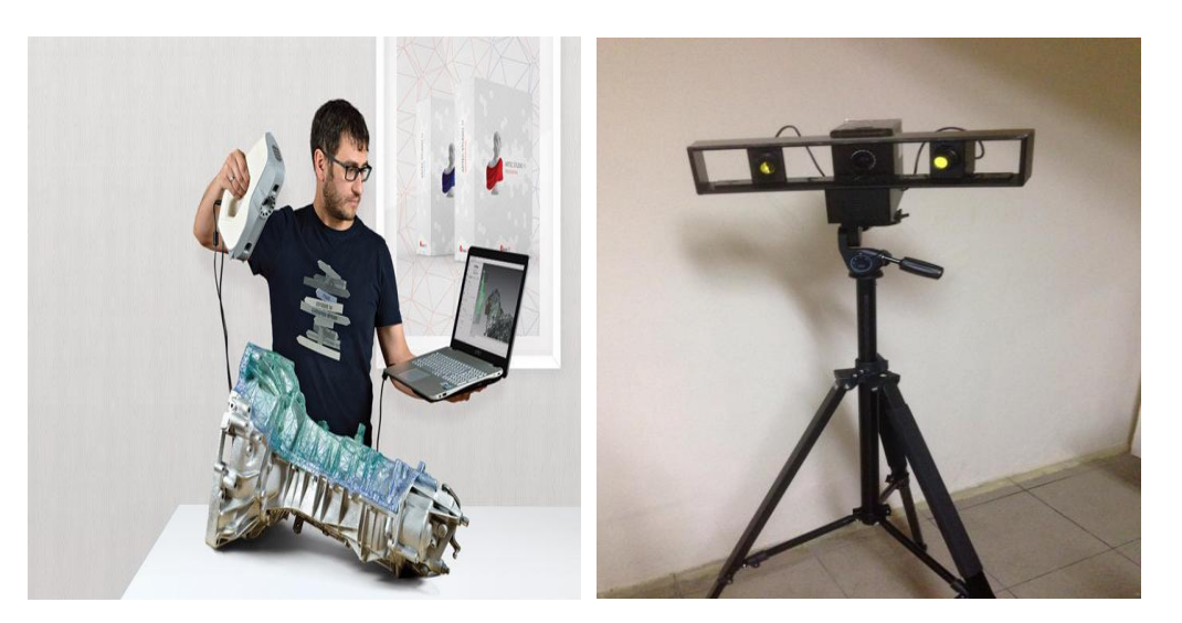
Figure 2.a and b. 3d optical scanning device.