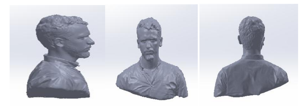
Figure 3.a. Scanning side view. Figure 3.b. Scanning Front view. Figure 3.c. Scan back view

The turntable setting is performed. The table is positioned on a lighted 3d table with the person standing still. The rotary table mechanism is operated. The second person with the turntable operation is positioned appropriately and the projection device is positioned to scan at the predefined angles. Browsing work is repeated for sections missing (non-reflecting regions).