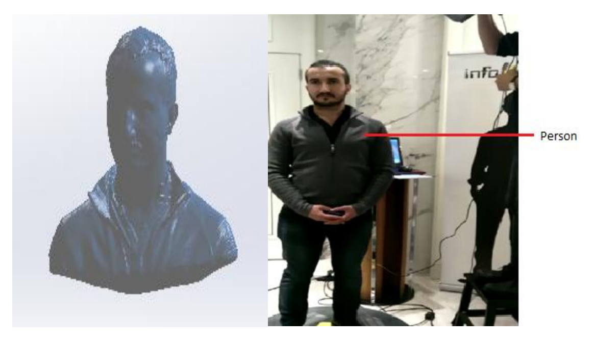
Figure 4.c. Screening process and result, front view