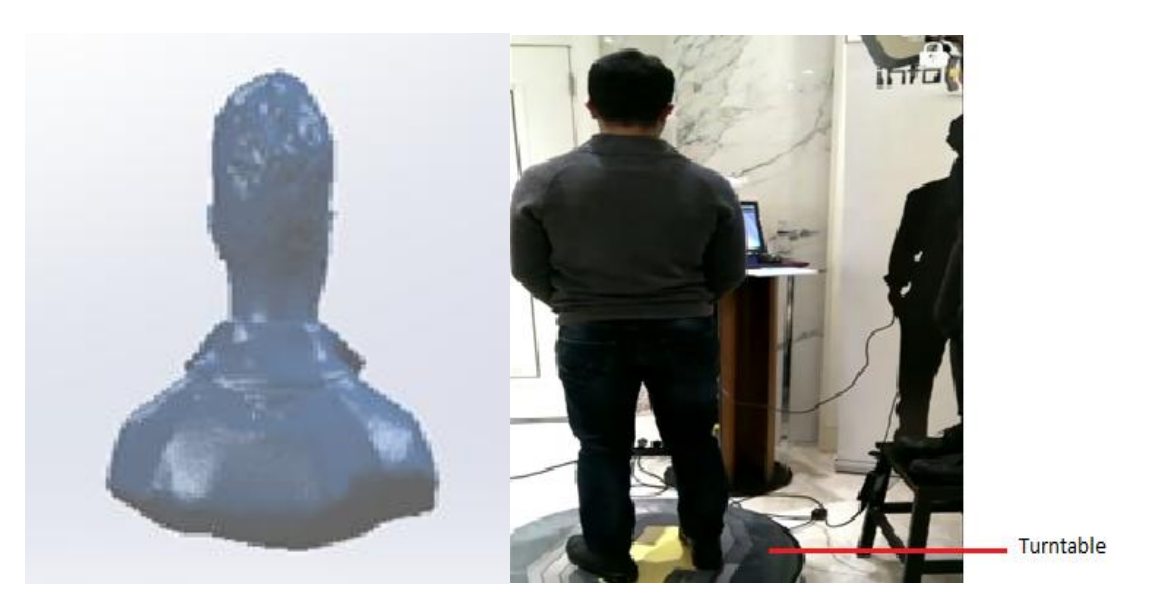
Figure 4.b. Screening process and result, rear view