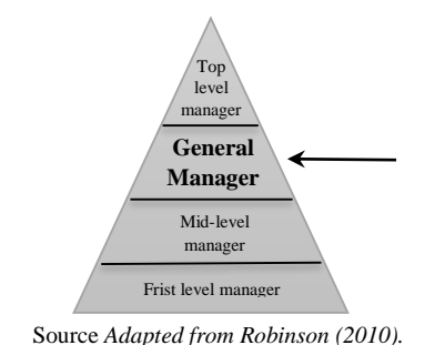
Figure 2. Position of general managers within hierarchical structure

as a part of management level in the structure of the sport clubs and they are among top and medium level managers within hierarchical structure (Figure 2).